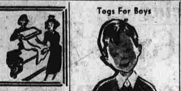
Togs For Boys

Let her try some on at MAR... Bargains Listed by The Inquirer... Colorful Cover-up... There Have Been Changes Made... If She Needs a Winter Coat... Party Idea... For Well-Dressed Boys... Touch of Distinction... August Savings on Bags... School Supply Headquarters... Don't Miss This!... Beautiful Head-First into a New... Still Yielding over 5 Per Cent... Save $60... Metal trim in the kitchen or bathroom tends to rust after being clipped and scraped during the years. Sand the rusty area clean it and shellac the spot when it is dry. Then apply a preservative paint to avoid further rusting.