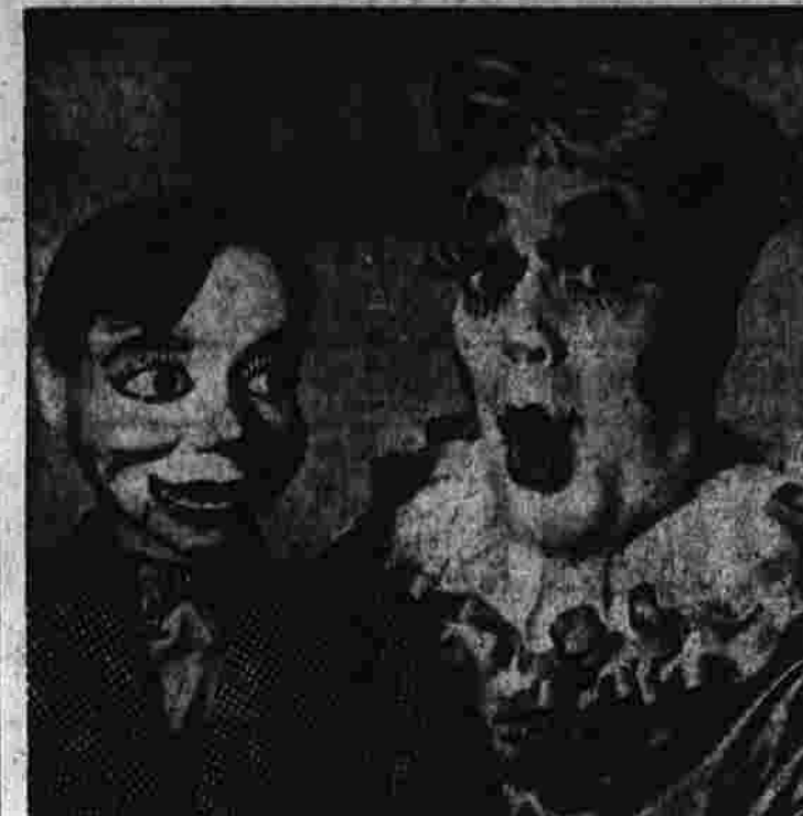
Columbia Fair Features

(Continued from Page One) ture as a united or divided country is agreed on. They also know Adenauer will resist such concessions to Russia as a ban on West Germany's use of American nuclear clear weapons. And they are determined to preserve Germany's military links with NATO after Adenauer quits public life—without killing all chance of agreement with Russia. Here is a run-down on other problems facing Eisenhower and Macmillan: 1. An East-West Summit Conference. The prime minister still considers such a meeting must be held soon on Berlin and the future of Germany. But he does not intend trying to pin the President down to any date, as he tried to do earlier this year. 2. Berlin and German Reunification. The two hope to get Russia to respect existing Allied rights in the city. 3. Red China's Role in the Far East. Special attention will be paid to Peking's relations with Moscow. The dangerous situation in Laos probably will be the starting point for discussion of Peking's bid for power and influence throughout Asia. Border troubles