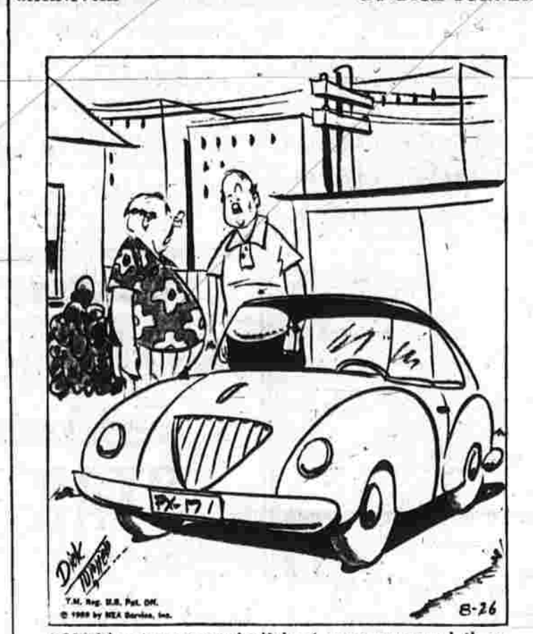
BY DICK TURNER